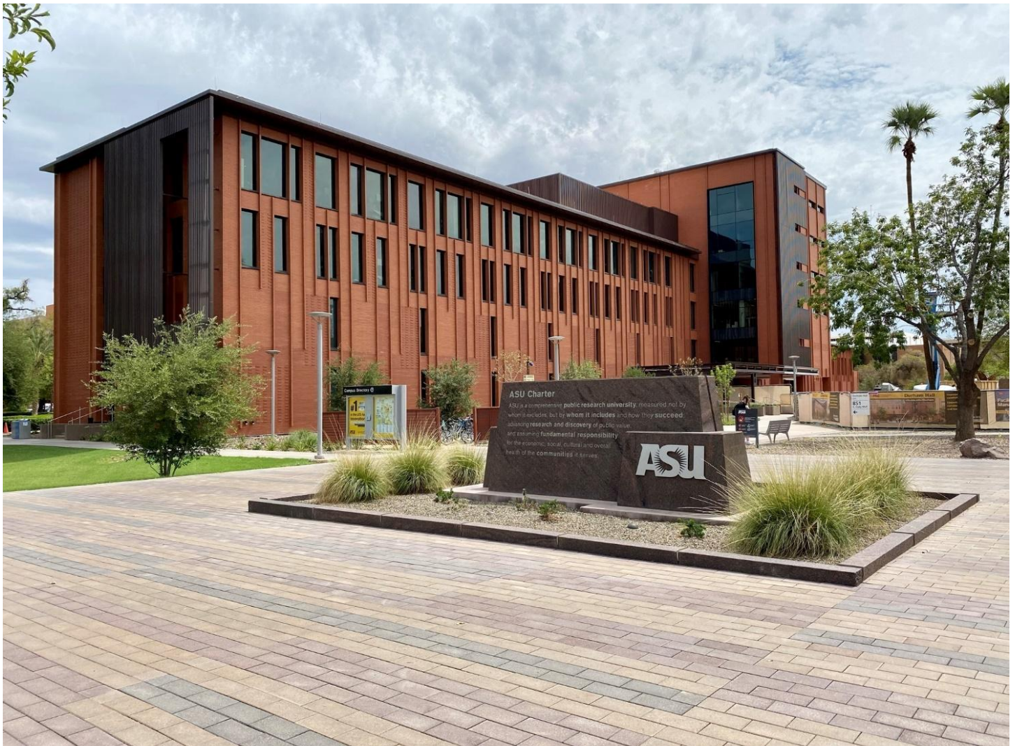
Durham Hall, the building where your CLI classes will be taking place

This handbook is to be used as a guideline only. Information is subject to change. If you have a specific question regarding the program, please reach out to cli@asu.edu .