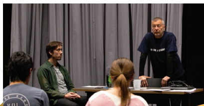
Macedonian film-maker Milcho Manchevski leads a directing masterclass.

35 students pursued in-depth research on the region through certificate capstones, senior thesis projects, internships or undergraduate fellowship programs.