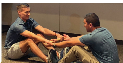
CLI Students participating in Yakut Stick Wrestling

ASU's Critical Languages Institute has offered high-quality, high-impact instruction for over 30 years, with over 2,000 learners enrolled since 1991. Following three years of adjustments to COVID-19, CLI 2023 reconfirmed the value of classroom camaraderie, mutual support and human connection in the intense and transformative work of learning foreign languages and cultures.