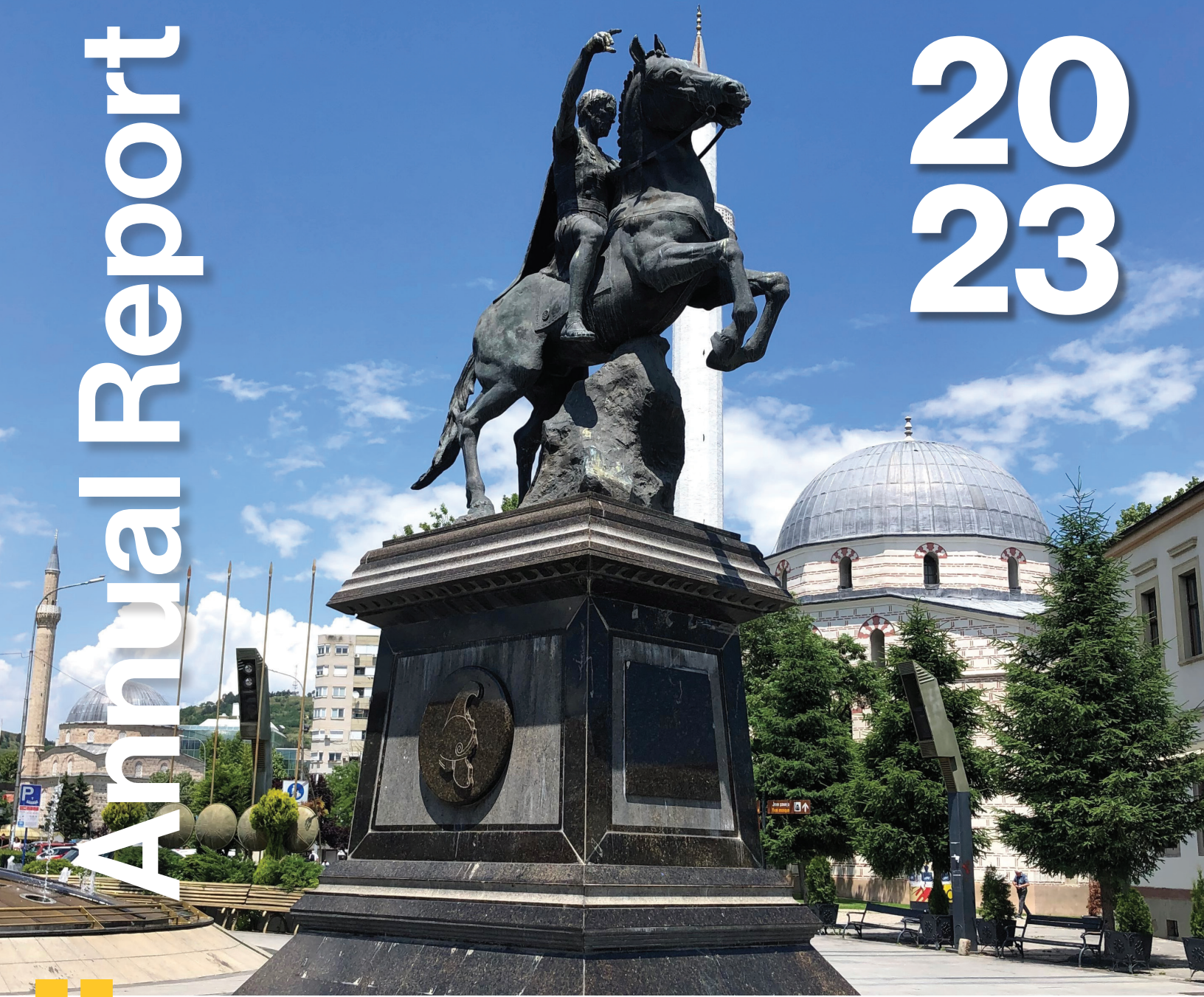
Philip II of Macedon in Bitola, North Macedonia.

2023 has been a transformative year, fueled by our 2022 designation and funding as a Title VI National Resource Center. New staff and faculty affiliates have injected energy as we've offered increased scholarship support, and expanded our engagement with partners and publics.