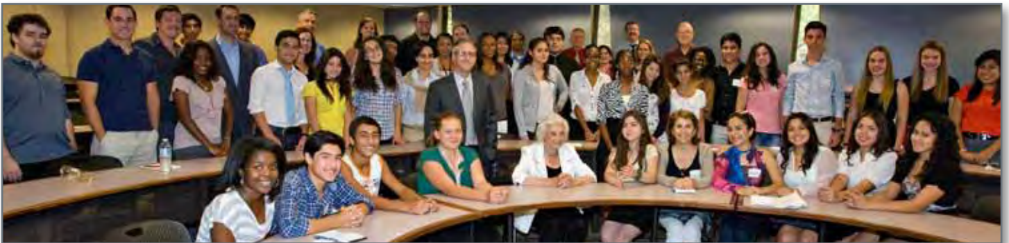
Supreme Court Justice Sandra Day O'Connor (center) with U.S. and Azerbaijani Youth Leadership groups