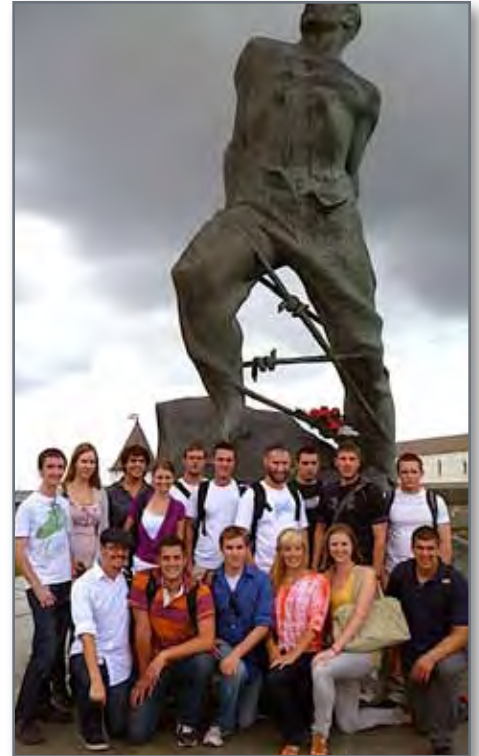
CLI Students in Kazan, Russia August 2012

In 2012, CLI was one of two summer language institutes in the U.S. to receive Title VIII Graduate Student Fellowship funding from the Department of State. (The other was the Summer Workshop on Slavic and East European Languages at Indiana University.) This funding allowed CLI to provide fellowships to 27 graduate students participating in Arizona-based and overseas CLI courses in the upper levels of the least commonly taught languages of Central Asia and Eurasia.