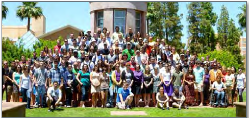
CLI 2012 students and faculty - Hayden Lawn, ASU

Due to visa difficulties, the CLI summer-long program for Russian had to be moved from CLI's traditional location of Kazan, Russia, to Kiev, Ukraine. Instruction in Kiev was provided by the Nova Mova