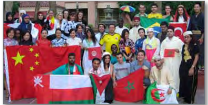
FLTA Orientation Participants at final banquet dinner

The orientation program hosted by the Melikian Center was designed to provide the FLTAs with an introduction to the academic and social cultures of U.S.