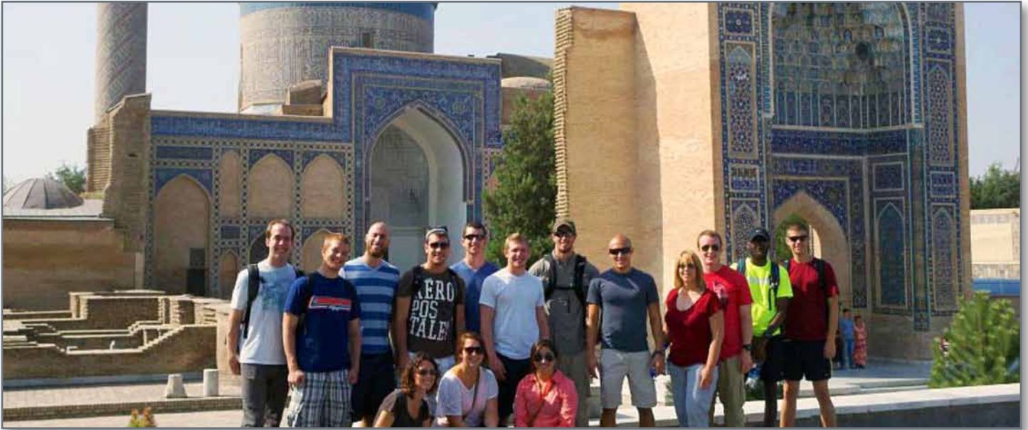
CLI 2012 Students in Uzbekistan

Preliminary data suggest that these students made significant and measurable language progress during their time at CLI. Title VIII funding will be available again in 2013.