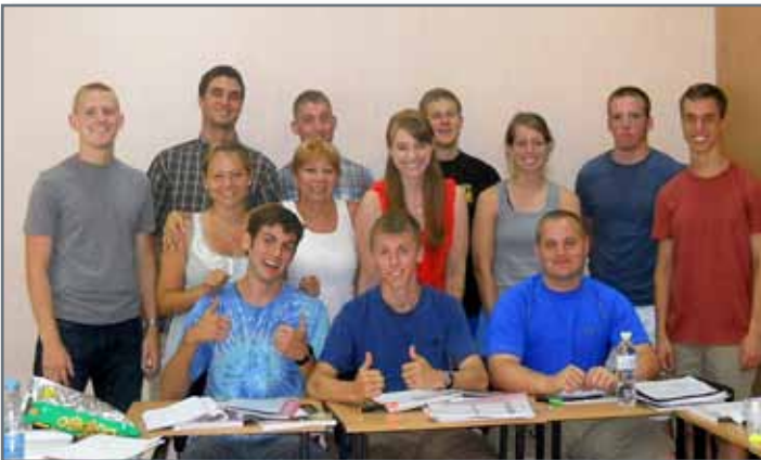
CLI 2012 students in Kiev, Ukraine

CLI also welcomed new faculty this summer. Elementary Bosnian/Croatian/Serbian was led by Jakov Causević, whose energetic and inventive classes were instrumental in doubling the size of the study-abroad program in Sarajevo (which he also led). Intermediate Bosnian/Croatian/Serbian was taught by Ellen Elias-Bursac, who in addition to being co-author of the