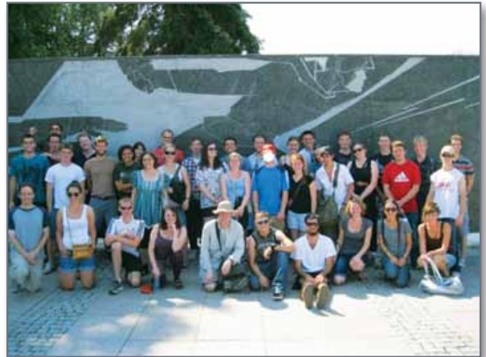
CLI 2011 Students in Russia