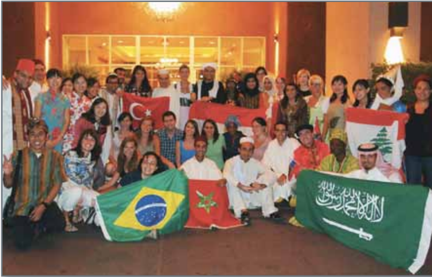
FLTA Orientation Participants at final banquet dinner

The Melikian Center welcomed 54 Fulbright Foreign Language Teaching Assistants (FLTAs) to national orientation program held August 26-31, 2011, on the campus of Arizona State University.