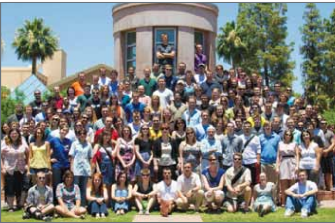
CLI 2011 students and faculty - Hayden Lawn, ASU

The Uzbek students were among the 84 students who studied abroad on CLI overseas programs this summer, with 44 students studying in Russia, 19 in Tajikistan, 11 in Uzbekistan, 5 in Bosnia-Herzegovina, and 5 in Armenia.