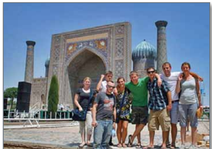
CLI 2011 Students in Uzbekistan

In another first, CLI opened a study-abroad program