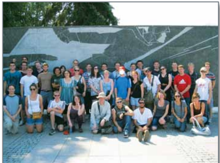
CLI 2011 Students in Russia