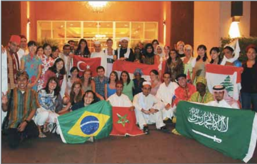
FLTA Orientation Participants at final banquet dinner

The Melikian Center welcomed 54 Fulbright Foreign Language Teaching Assistants (FLTAs) to national orientation program held August 26-31, 2011, on the campus of Arizona State University.